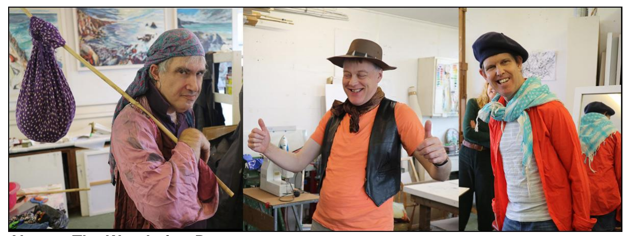
Above: The Wandering Dreamers

4 costume upcycling sessions were arranged in Oct/Nov where small groups decided on their characters, the names of their groups and the parts they might play along to their music – these groups were kept secret from each other.