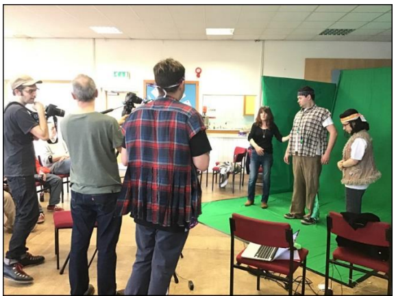
"I just wanted to say what a great day it was on Saturday. I was struck by how much the pieces of music, the performances and the costumes came together giving each group a very different, but very relevant identity. It was a joy to watch the participants perform. Thank you once again for such an inspiring and worthwhile project. You have created a wonderful supportive and creative community within APEX"

"Love how Apex creates such a safe, accepting and open environment which allows everyone to just be themselves. Watching people grow in confidence as the afternoon progressed was just great"